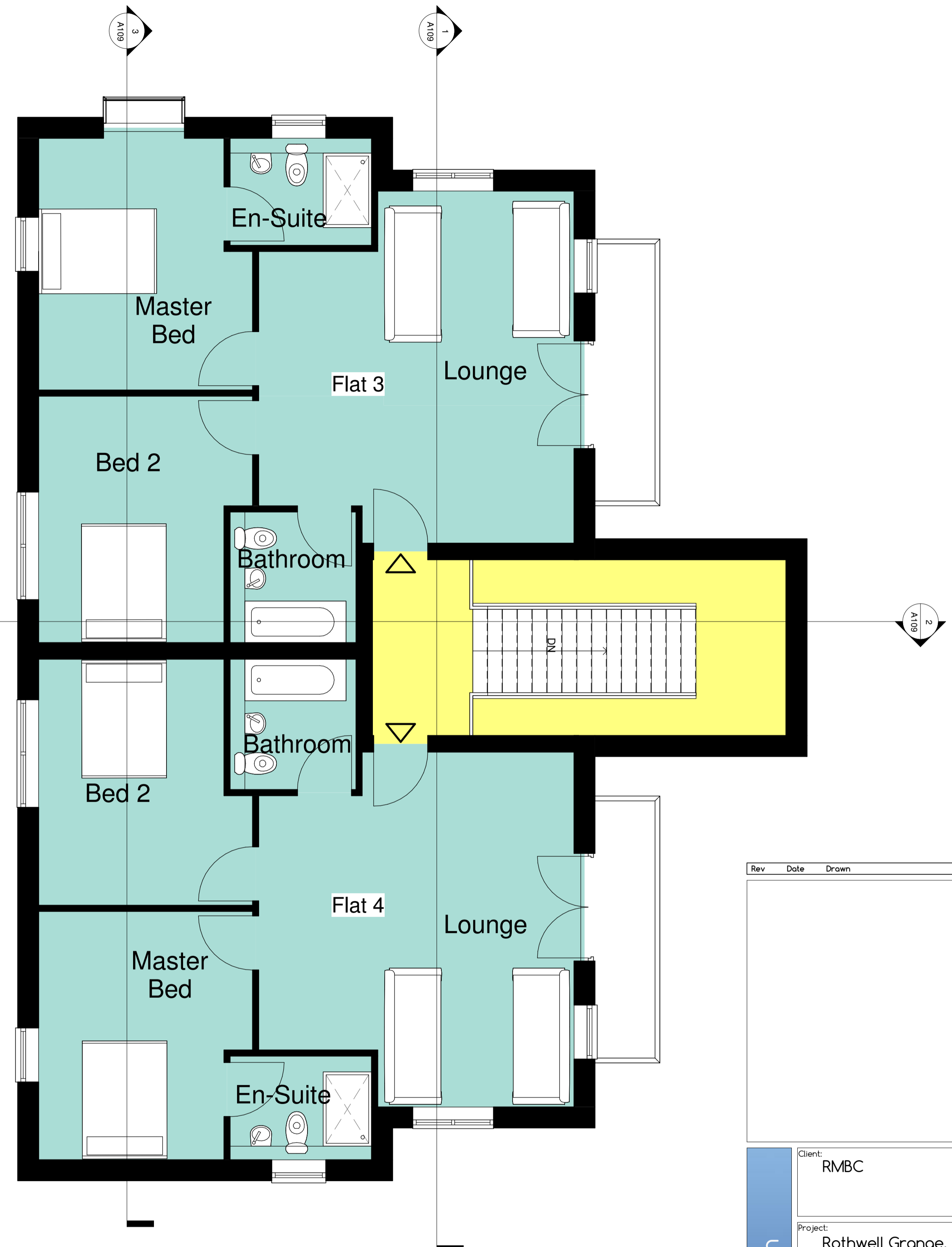
First Floor Plan - 160m 2 (1723ft 2 ) Scale:1:50